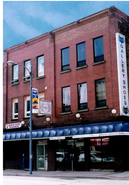
The Ladies' Reading Room was located in "a large and airy upper floor room" in the Lyon's Building, 158 Water Street.

( https://www.heritage.nf.ca/articles/society/womens-history-group.php )