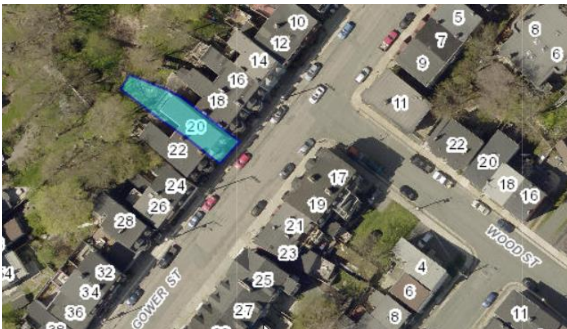
Location of Subject Property 20 Gower Street