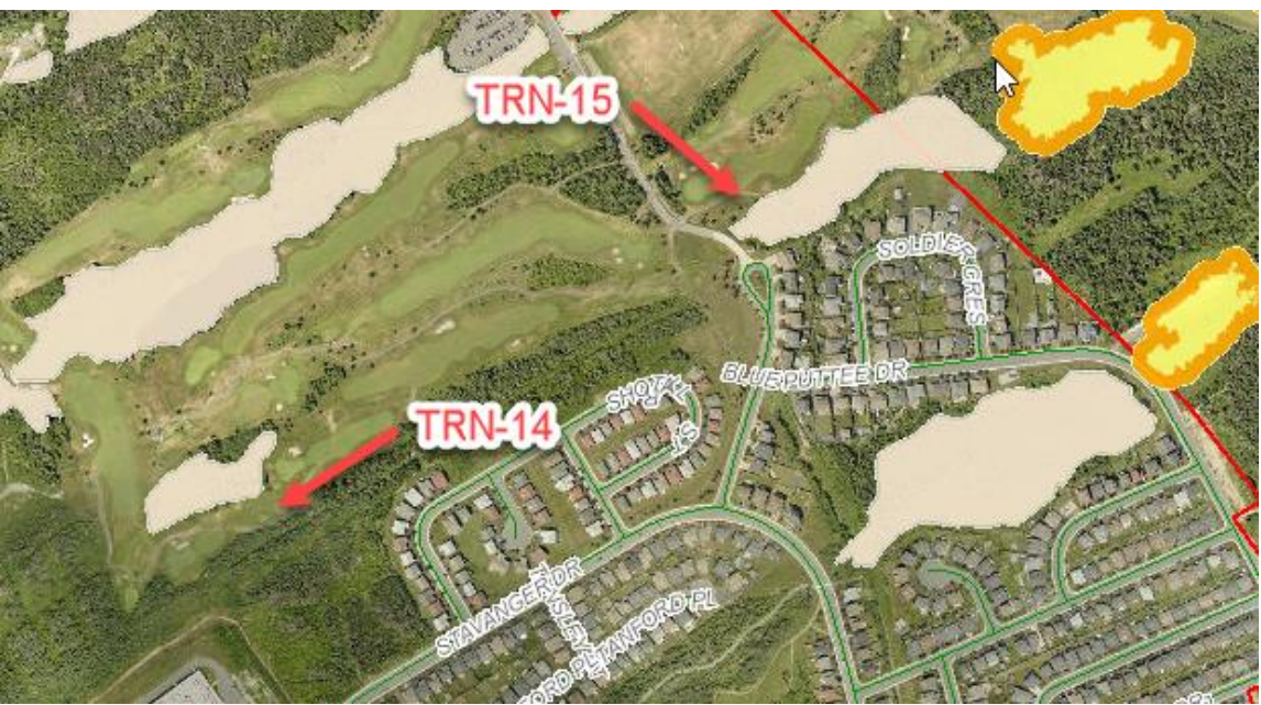
Wetlands TRN-15 and TRN-14 are both in the new Bally Haly golf course, formerly called the Clovelly golf course; development of the wetlands would be unlikely.