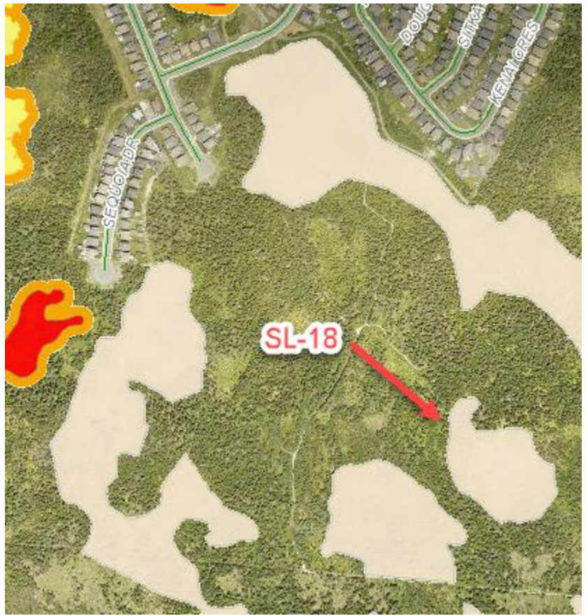
Wetland SL-18 is one of the smaller wetlands in the Southlands neighbourhood.