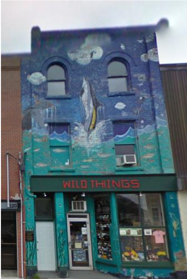
Previous Mural ~late 1990s/early 2000s to 2018