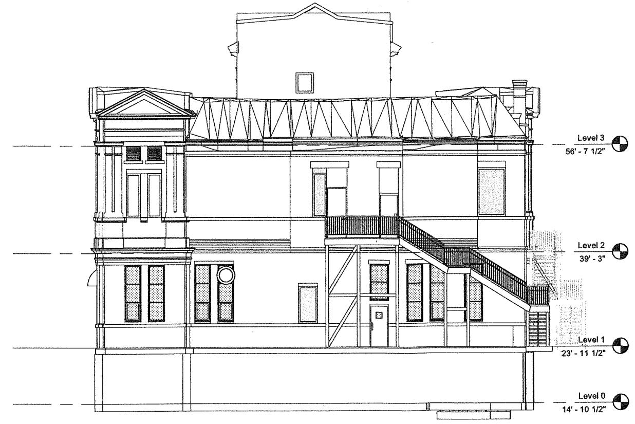
A4 OVERALL EAST ELEVATION SCALE: 1/8" = 1'-0"