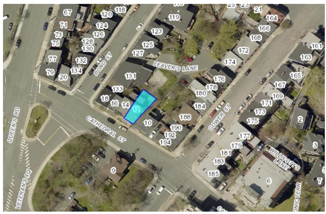
12 Cathedral Street Heritage Area 1