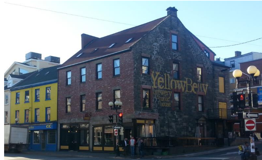
Water Street Historic District

Make recommendation to Council, via the Committee of the Whole.