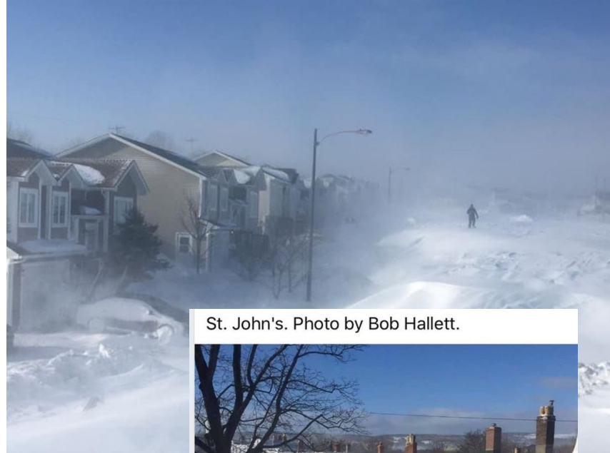
St. John's.