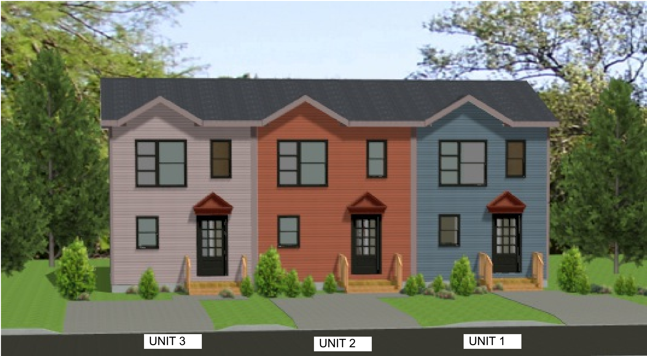
Proposed Townhomes Elevation 138 Ladysmith Drive

www.rjroberts designplanning.ca 709- 753 8169