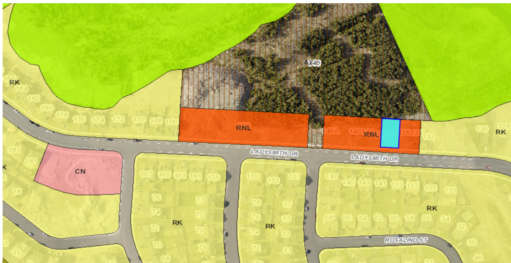
138 Ladysmith Drive and surrounding area